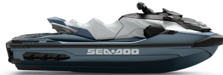
● Blue Abyss