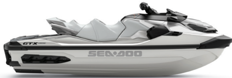
○ NEW White Pearl Premium