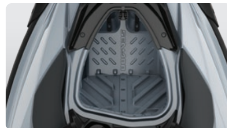
Large Front Storage An impressive 40 gallons of sealed storage space allows riders to safely stow belongings while riding.