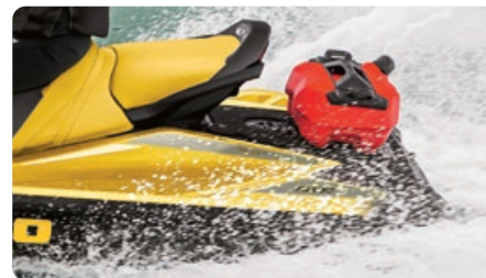
Swim Platform with Integrated LinQ® System Exclusive quick-attach system on a large swim platform that allows for easy installation of storage accessories.