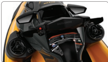
BRP Audio - Premium System (Optional) The industry's first manufacturer-installed truly waterproof Bluetooth® audio system.