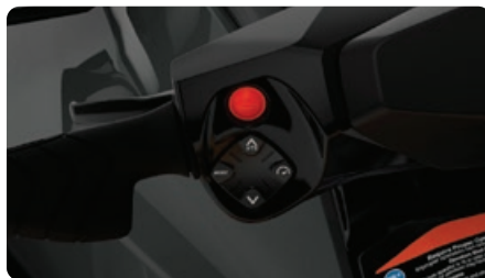
VTS™ (Variable Trim System) Provides handlebar-activated settings so riders can easily find the ideal trim for varying conditions.