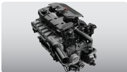
ROTAX® 1630 ACE™ - 230 Engine This powerful engine comes standard with a supercharger and external intercooler. It is optimized to run on regular fuel, which lowers fuel costs.